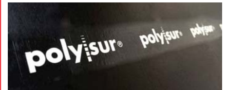
Polysur® elevator belts are provided with a Polysur® logo after each 20 meter of elevator belt.

Other constructions available on request.